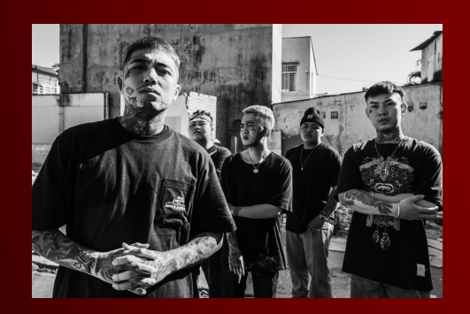
GANGS, ORGANIZED CRIME