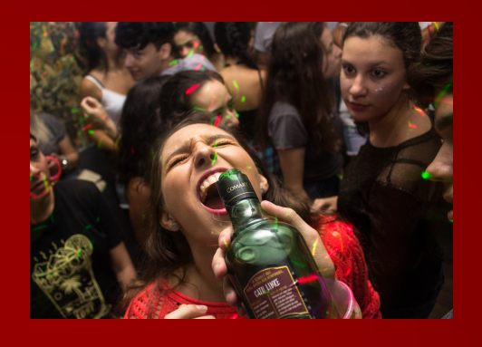
HOUSE PARTIES, CLUBS