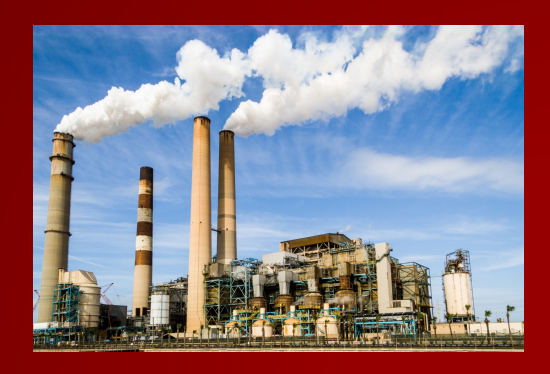
INDUSTRY, WORK CAMPS, FARMS