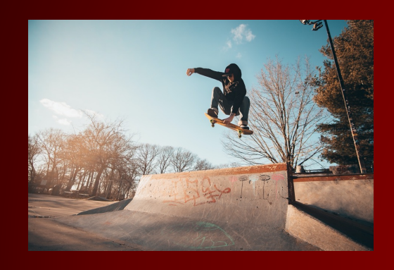
WHERE YOUTH HANG OUT