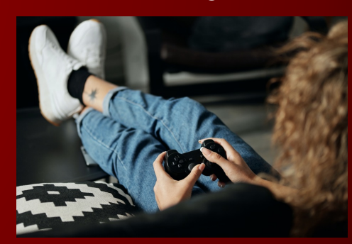
SOCIAL MEDIA, ONLINE GAMING