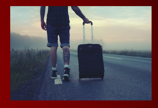
HITCHHIKING CABS/RIDESHARING/ FERRIES