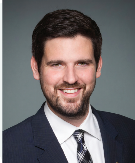
The Honourable Sean Fraser, P.C., K.C., Minister of Justice and Attorney General of Canada and Minister responsible for the Atlantic Canada Opportunities Agency

Thank you and I hope you have a wonderful gathering.